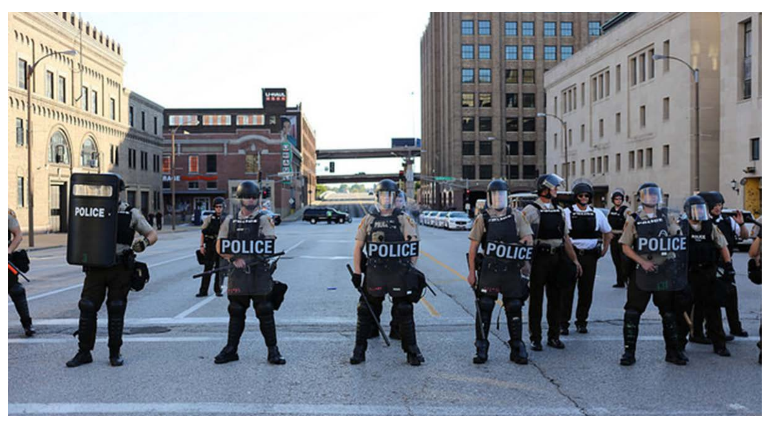
photo credit: Paul Sableman under creative commons license https://creativecommons.org/licenses/by/2.0/legalcode